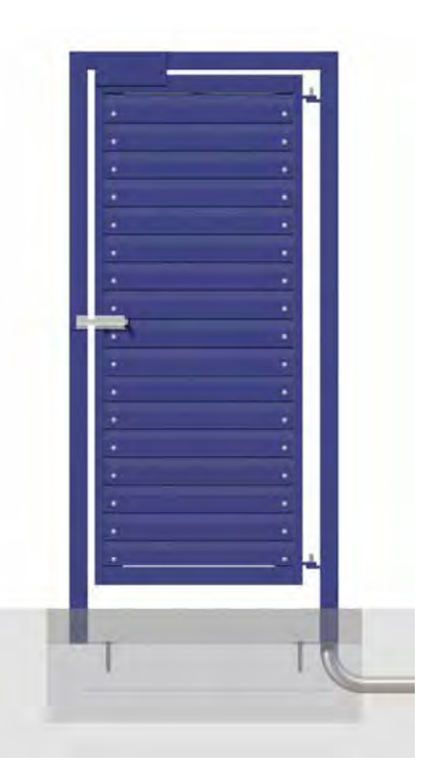
Applications: The popular pedestrian gate that is frequently installed adjacent to turnstiles to provide DDA pedestrian access.